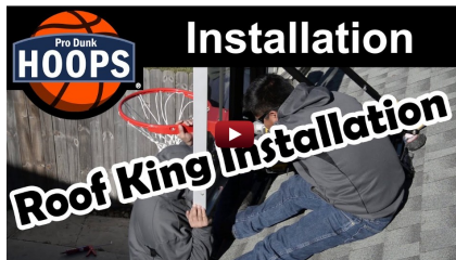
Roof King Bracket Dimensions

www.produnk.com/video/roof_king_installation.html